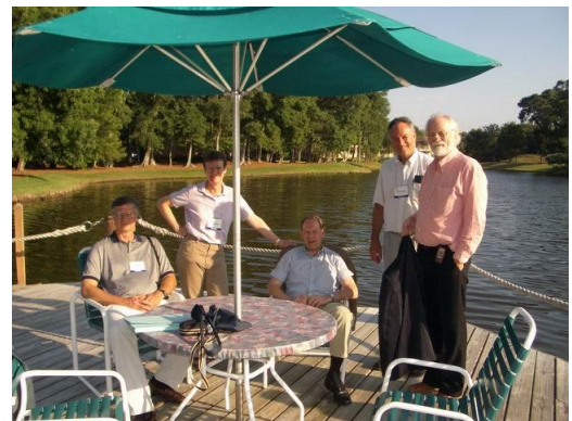
IPSO Executives at the IPSO/APSA meeting in Ponte Vedra Beach, Florida