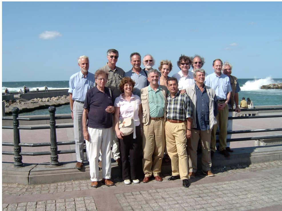
IPSO at Alexandria's Port