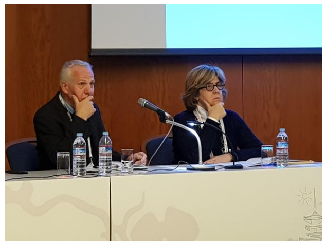
International Society of Paediatric Surgical Oncology